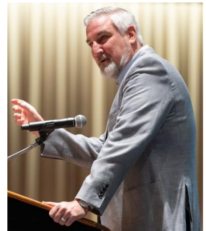
Gov. Eric Holcomb thanks conference attendees.